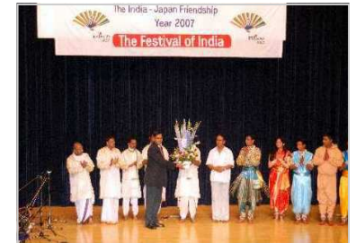
Cultural Affairs Agency-Subsidized Project in 2007 India's Mask Dance, Seraikela Chhau Performances in Japar